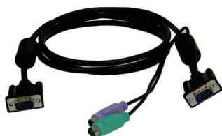
PS2 KVM Cable