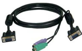
PS2 KVM Cable

Keyboard layout: CH, FR, GR, IT, JP, KR, PT, RU, SP, UK, US