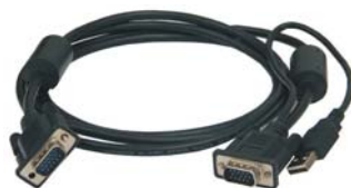
USB KVM Cable